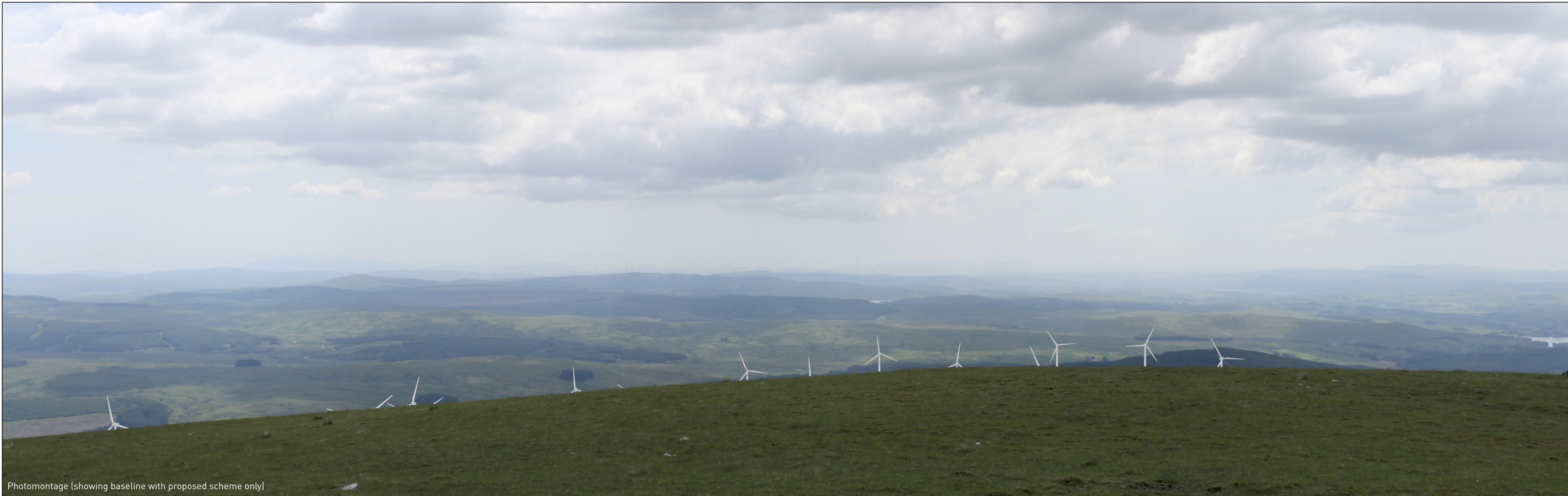
Photomontage (showing baseline with proposed scheme only)